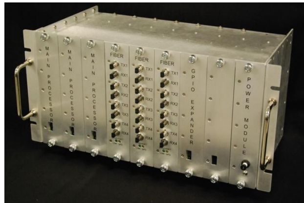
Chassis with Modules Installed – RG Configuration